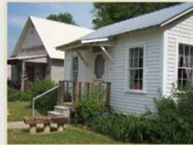
Smith Country Store & Ruth Home Demonstration Clubhouse

The museum contains displays depicting various occupations and household areas with furnishings from original businesses or typical furnishings for the times. A large number of tools and other items are displayed throughout the building.